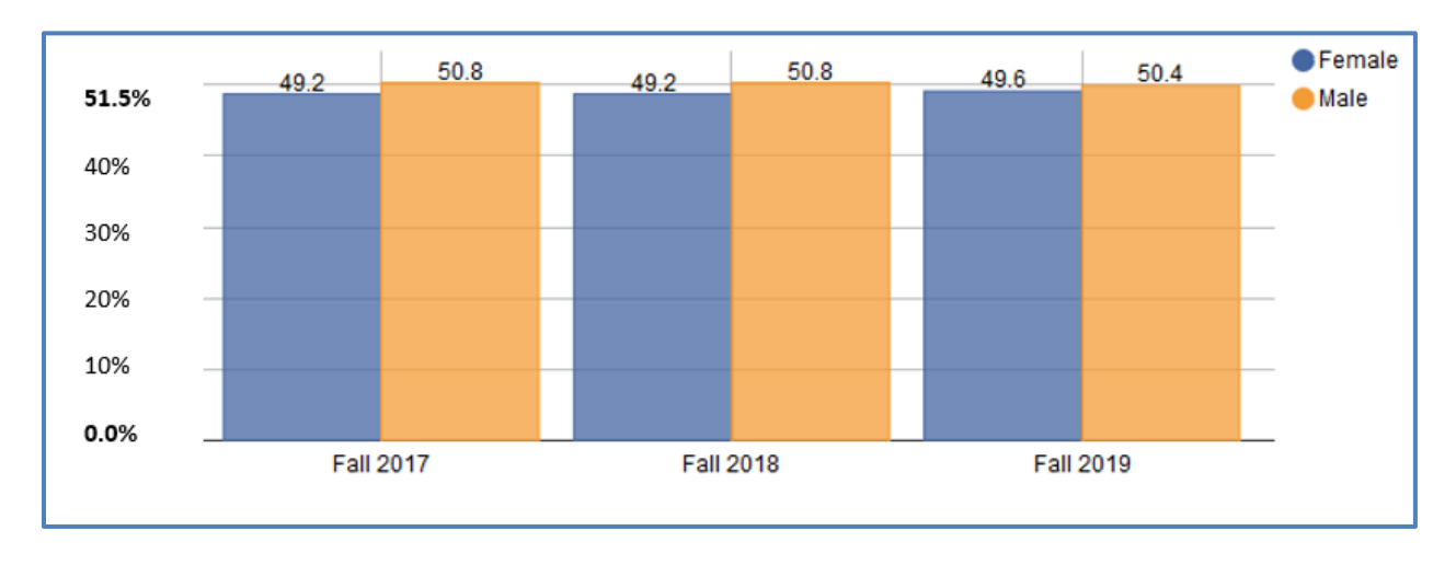
Figure 2. UToledo Student Enrollment by Gender, by Percentage for Fall 2017–2019 shows the breakdown of the UToledo student body by gender from 2017 to 2019.