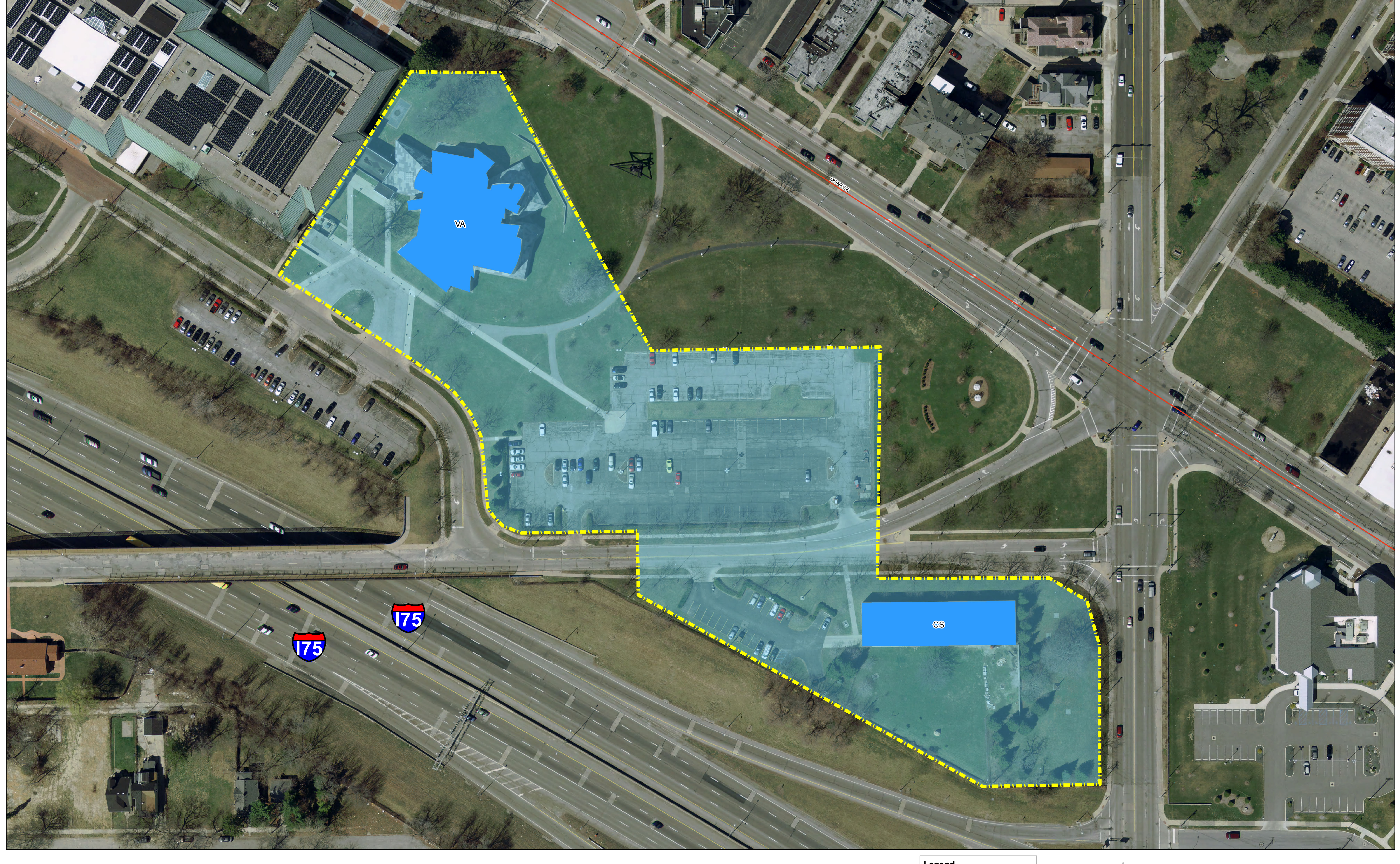
THE UNIVERSITY OF TOLEDO - Museum of Art Campus