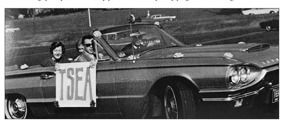
CRUISING: Members of the Toledo Student Education Association rode in the 1965 Homecoming parade.

There was a shift in the purpose of schooling nationwide, moving from purely academics to teaching the whole child and schooling for life. As usual, the College of Education kept up with the trends; by the 1940s, there was a rise in vocational education and preparing teachers for the trades of northwest Ohio, physical education, as well as explicitly progressive teaching courses. The