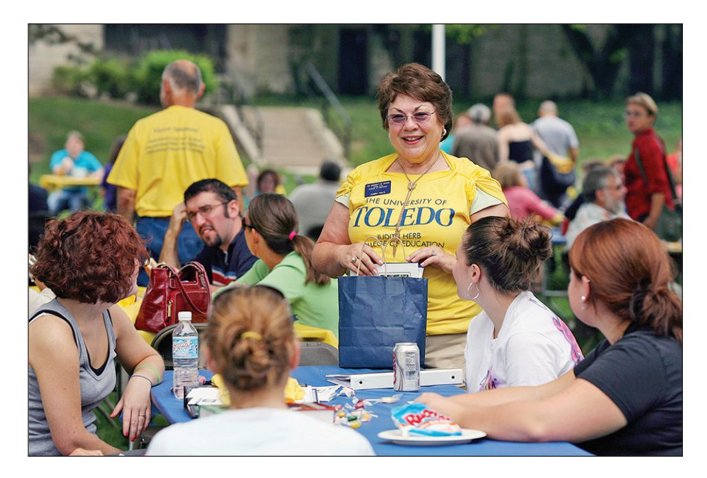
SPECIAL GUEST: Judith Herb talked with students at the Judith Herb College of Education's 2006 fall welcome picnic.

As the purpose of schooling expanded and the baby boom created a tremendous need for teachers, by the 1950s, in addition to elementary and high school teachers, the college was producing teachers in vocational education, physical education, business education, home economics and art. The college was experimenting with a series of