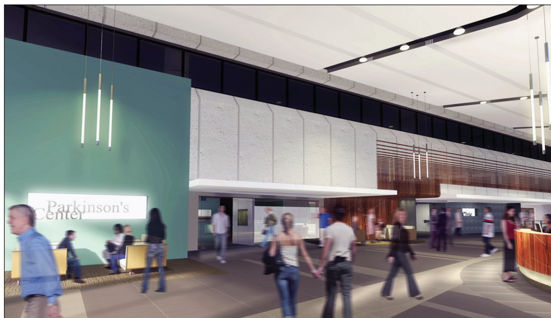
This rendering by the Collaborative Inc. of Toledo shows what the Gardner/McMaster Parkinson's Center may look like when finished in 2013.