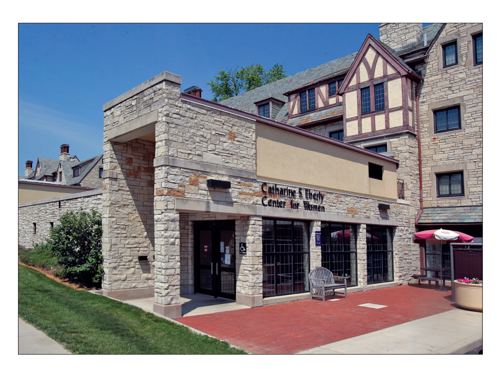
Catharine S. Eberly Center for Women

Some of the renovations to the Eberly Center include a new quiet room for breastfeeding and a library room, which used to be housed in the computer lab.