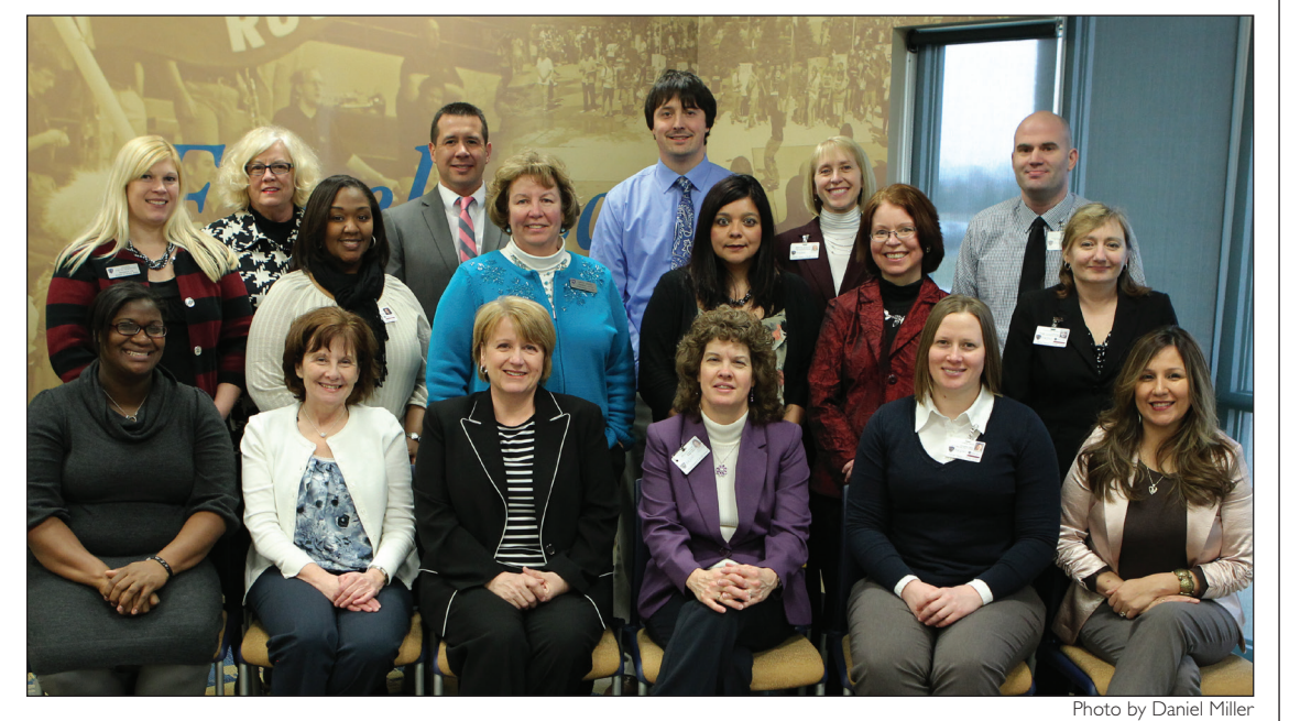
TEAM SHOT: The iCoaches — staff members dedicated to transforming the student experience — posed for a photo in Ottawa House.

These iCoaches are starting with the training of two foundational principles: