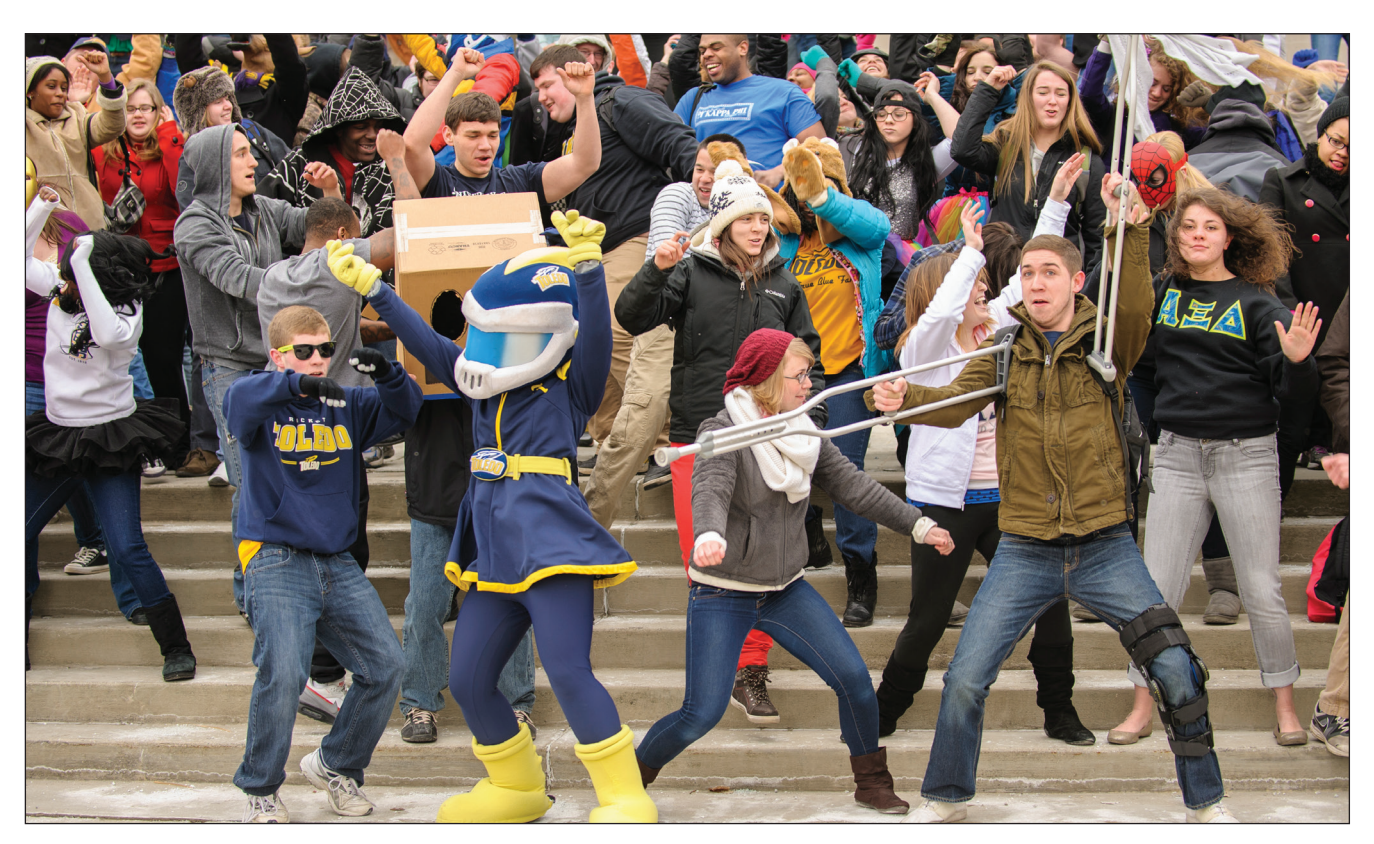
SHAKE, SHAKE, SHAKE: Rocksy the Rocket danced alongside students doing the Harlem Shake, an Internet video trend, last week on the steps of the Student Union.Watch the video at http://utole.do.shake.