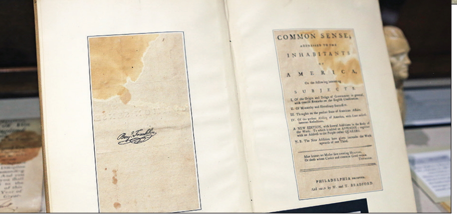
Benjamin Franklin's signed copy of Common Sense is part of the "Letters of Luminaries" exhibit.