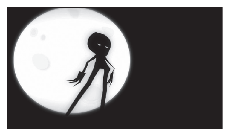
This still is from "The Figure and the Mind" by Crista Constantine.