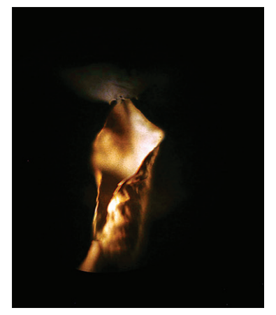
These images are from Jim Jipson's exhibit titled "Chthonic."