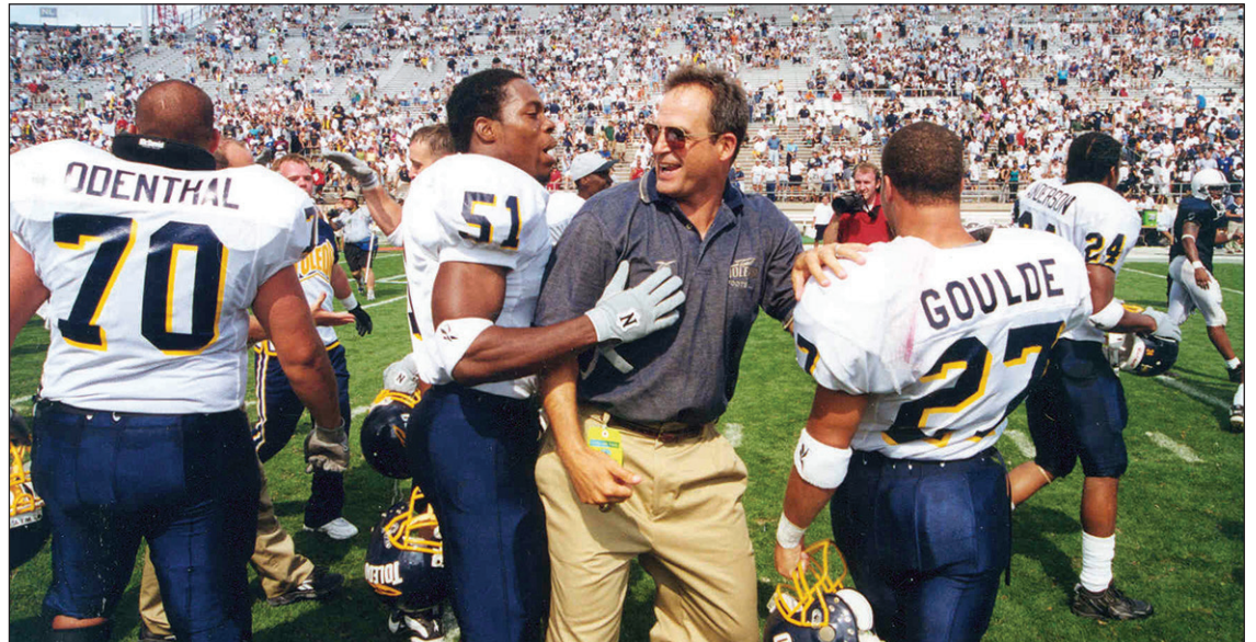
BIG WIN: Gary Pinkel and the Rockets celebrated a 24-6 victory over Penn State in Happy Valley in 2000.

He was MAC Coach of the Year in 1995 and 1997. Pinkel left Toledo after the 2000 season to accept the head coaching position at Missouri, leading the Tigers into the top 10 in 2007 and 2008, as well as to SEC East titles in 2013 and 2014. He is Missouri's all-time leader in wins (113-66),