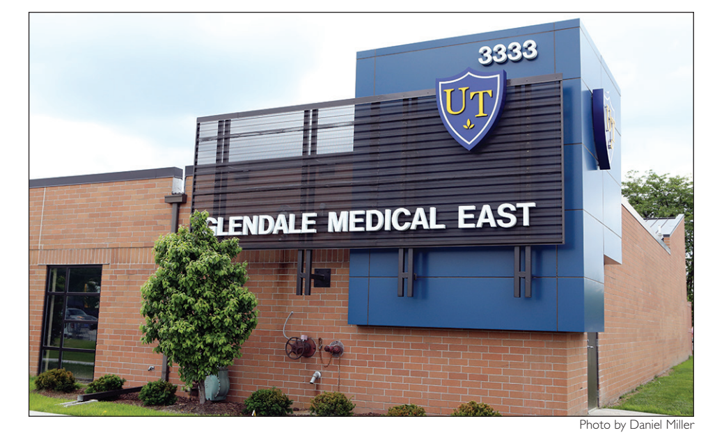
A ribbon-cutting ceremony will take place Tuesday, June 30, at 10 a.m. at the building now called Glendale Medical East, 3333 Glendale Ave.

The opening of the center at Glendale Medical East coincides with the return of the