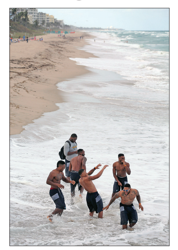
BEACH BOYS: Members of the Toledo Rockets football team romped in the surf of the Atlantic Ocean Dec. 19.