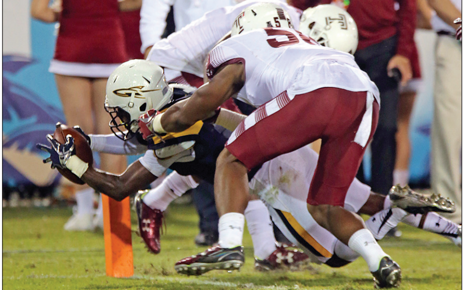
BOCA RATON REGIONAL HOSPITAL 800 Meadows Rd EMFT CY