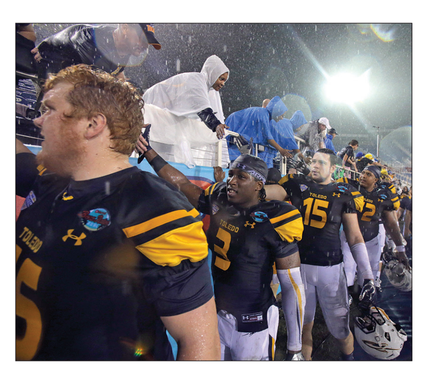
HIGH-FIVES: Players thank the Rocket faithful after the big bowl victory.