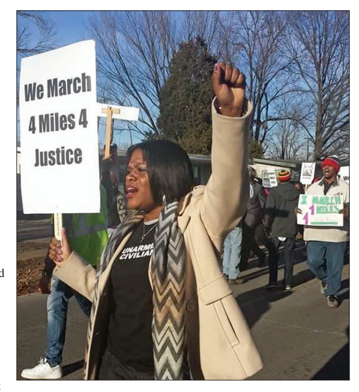
WALKING THE WALK: Pastor Cori Bush participated in a 4 Miles 4 Justice event to fight for human rights.