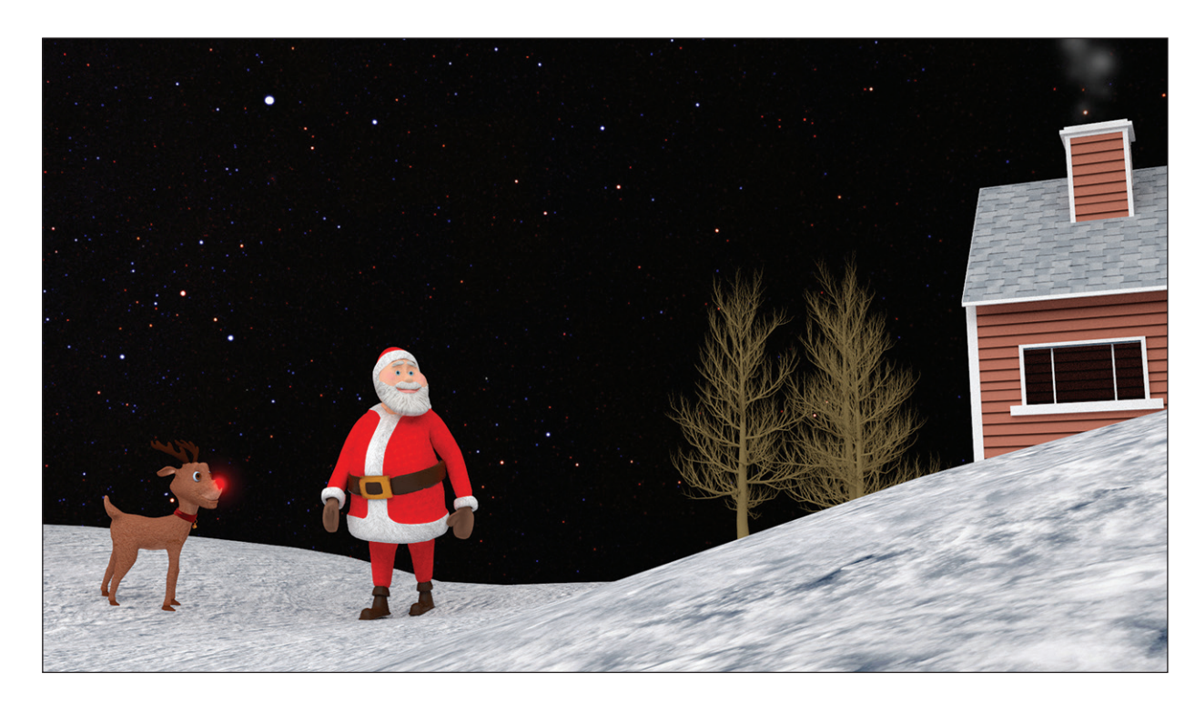
READY FOR TAKEOFF: Rudolph and Mr. Claus use the constellations to navigate during their annual trek around the world in the UT Fulldome Studio production of "Santa's Secret Star," which can be seen Fridays and Saturdays through Dec. 17.

After Friday night programs, guests are taken to one of two of the observatories for sky viewing, weather permitting.