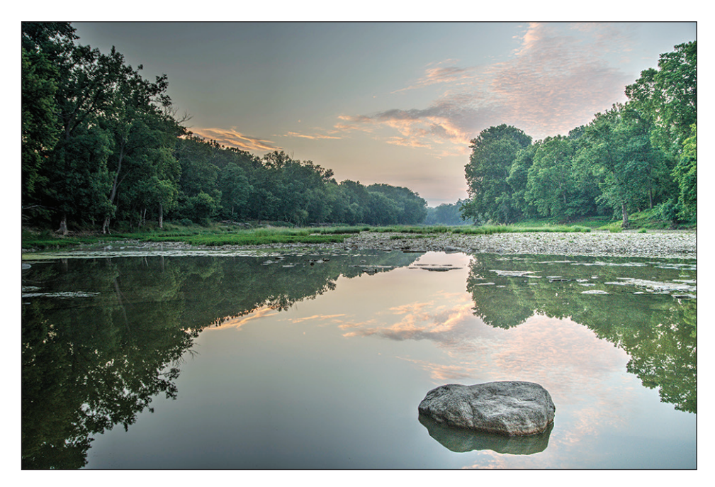
Ginny Sussman placed first in the adult category with this photo of the Maumee River at Side Cut Park.