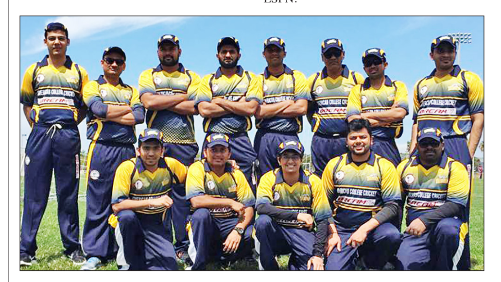
READY TO COMPETE: The UT Cricket Club is one of 24 teams that will play in the American College Cricket Nationals starting March 15 in Fort Lauderdale, Fla.

People interested in watching a cricket match can find games at Beatty Park in Toledo; Lyon Oaks Cricket Field in Wixom, Mich.; and Murphy Park in Pontiac, Mich. Fans also can watch on Sony Six Live and ESPN.