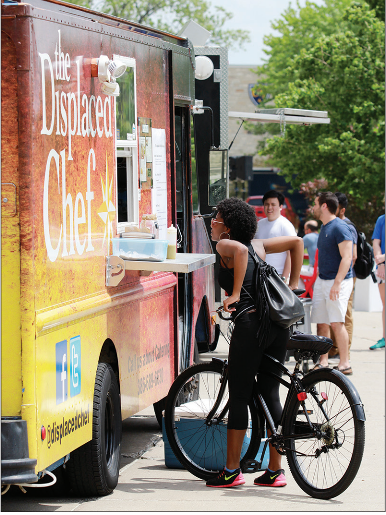
A bicyclist wheeled up and placed an order at the Displaced Chef during Rocket Recess at Work May 17 on Main Campus.