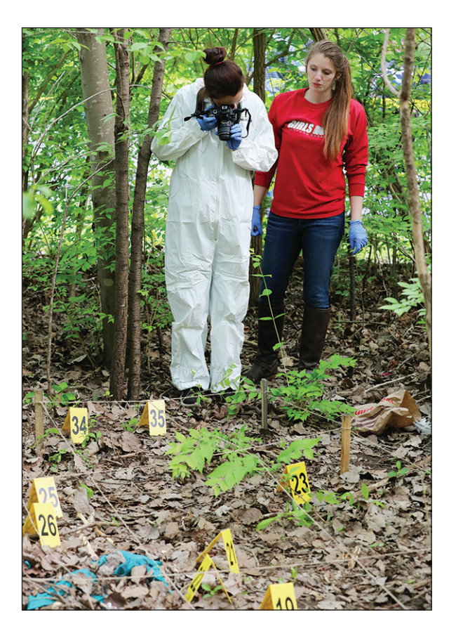
CLICK: A student took a photo at the mock crime scene to document evidence.