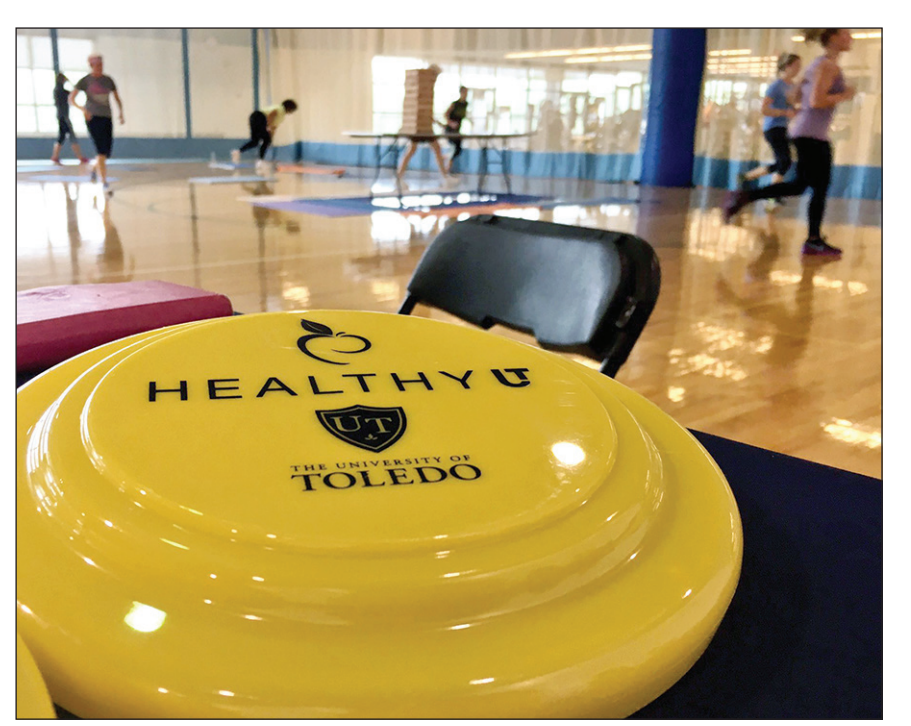
Rainy weather May 25 moved Rocket Recess at Work inside the Morse Center on Health Science Campus.