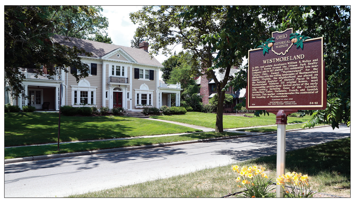
BEAUTIFUL DAY IN THE NEIGHBORHOOD: Check out the homes in Westmoreland, which was placed on the National Register of Historic Places in 1986. Even if it's not a beautiful Thursday, Aug. 3, bring an umbrella for the free walking tour.