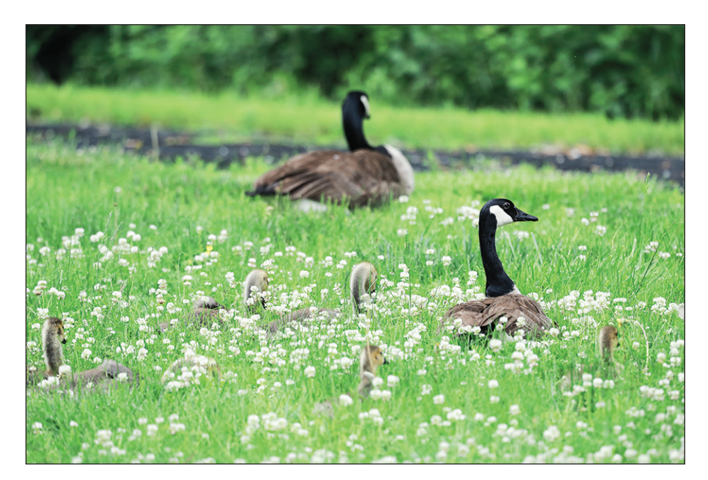
Several families of geese recently gathered to eat and rest on the west side of Carlson Library by the Ottawa River.