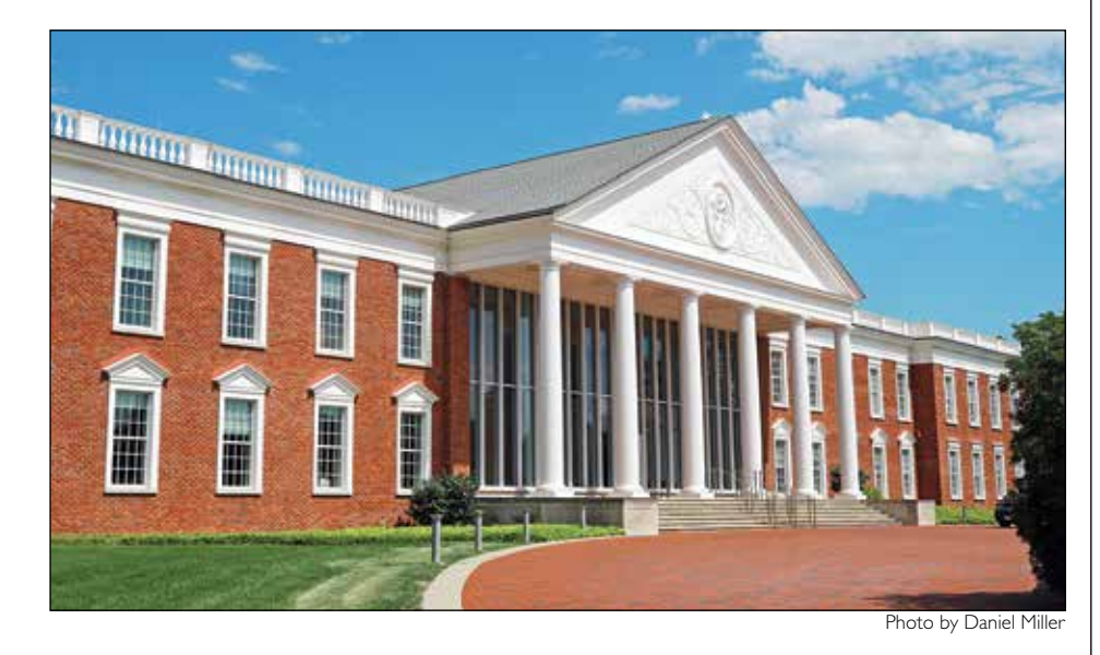
NEW LOCATION: The UT Foundation offices are scheduled to be at the new Center for Alumni and Donor Engagement, 4510 Dorr St., Jan. 3. UT Development, Alumni Engagement, and Special Events offices also are slated to move to the new center by the end of January.