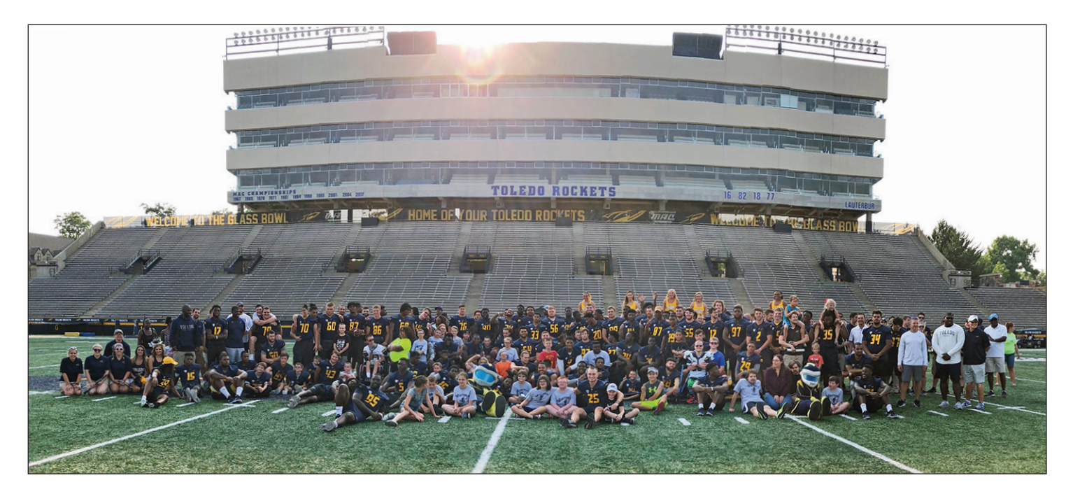
MEMORABLE DAY: Members of the Toledo football team, cheerleaders, and the marching band posed for a photo with local special needs students who visited the Glass Bowl for Victory Day.

The Rockets first celebrated Victory Day came in 2014.