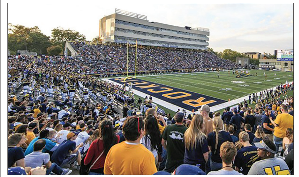
SEE YOU AT THE GAME! An average of 20,745 fans packed the Glass Bowl each game last season.

Season tickets start at $80. UT faculty, staff and retirees can purchase up to two season tickets at half price (additional at full price); UT students are admitted free with IDs. To purchase 2018 season tickets, go online at utrockets.com, call 419.530.GOLD (4653), or stop by the UT Athletic Ticket Office at Savage Arena.