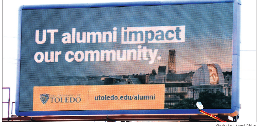
NOW UP: This billboard at Monroe Street and Douglas Road is one of 14 in the area that are part of UT's new ad campaign focusing on local alumni and their success stories.

To donate or register to help at the event, go to https://give.fmsc.org/Toledo.