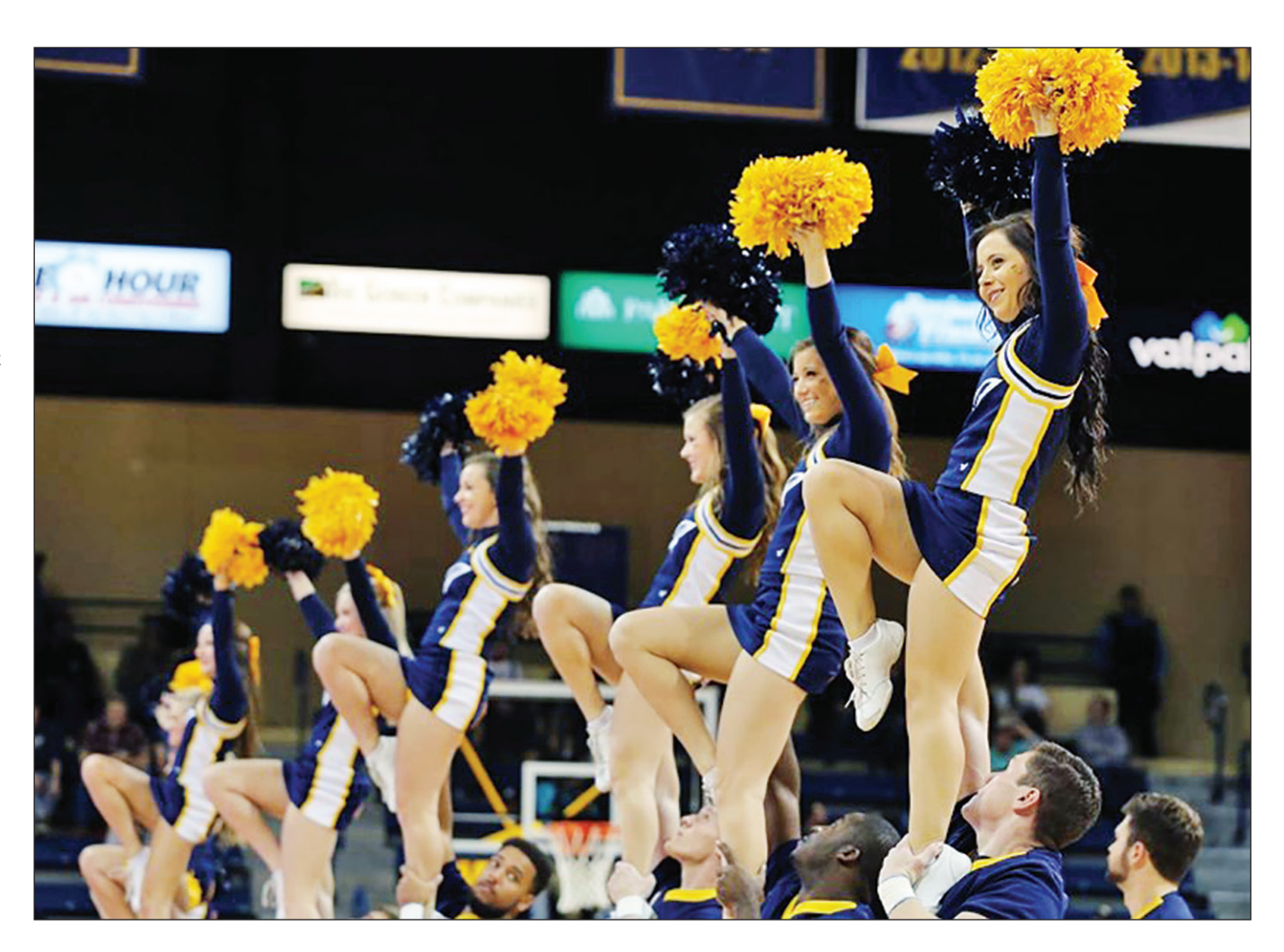
CATCH THE SPIRIT: The UT Cheerleaders will hold a clinic for kids Saturday, Feb. 3.

Fans can purchase additional tickets for $7 by using the promo code "CHEER" at https://www.ticketreturn.com/prod2/BuyNew.asp?EventID=220815#.Wkz9iXlG270??.