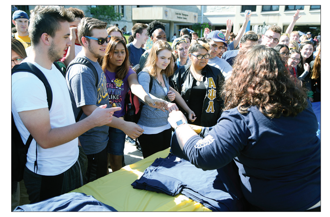
Students were all about scoring free Homecoming T-shirts during the Rocket Luau.