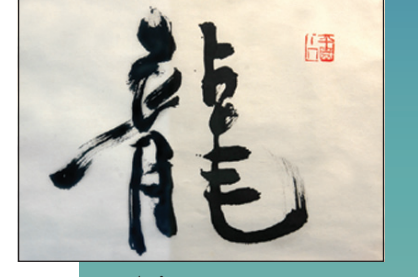
Asian art page 8