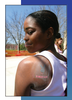
Tatooed! page 3