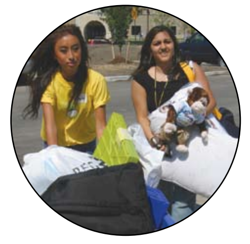
Students move in to Ottawa House

• The Rockets accept an invitation to play in the GMAC Bowl Dec. 21 in Mobile, Ala.