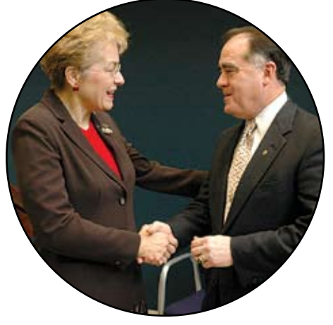
Congrats on grant for National Center for Parents