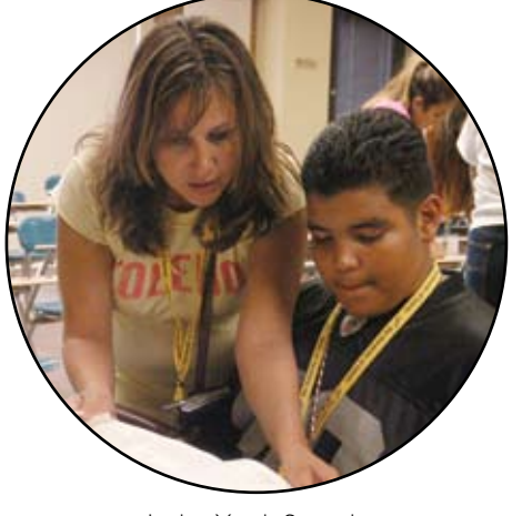
Latino Youth Summit

• A new CD, Jazz at The University of Toledo , is released just in time for the Art Tatum Jazz Heritage Festival.