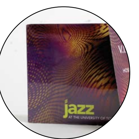
UT's jazz CD