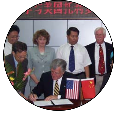
UT delegation visits China