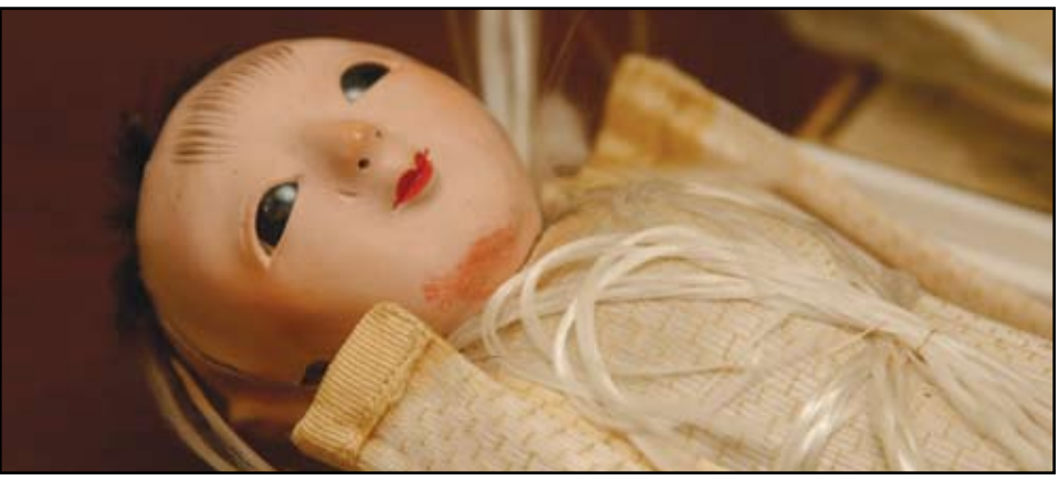
A rare doll made from spun glass, the precursor to fiberglass, is one of the artifacts in the Owens-Illinois Inc. collection. The doll was made by the Libbey Glass Co. for the 1893 World's Columbian Exposition in Chicago.