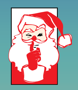
Secret Santa page 5