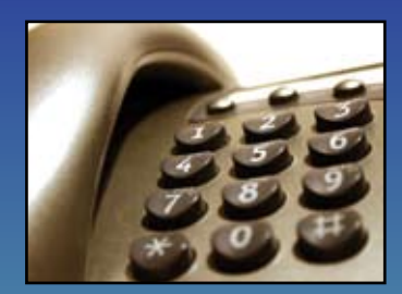
Just say it page 3