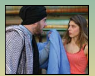
Drama unveiled page 5