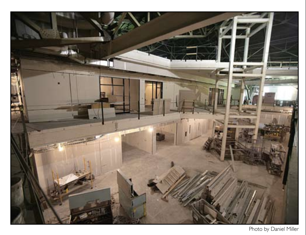
GOING UP : All three floors of the Memorial Field House, including classrooms and a new elevator shaft, have begun taking shape.