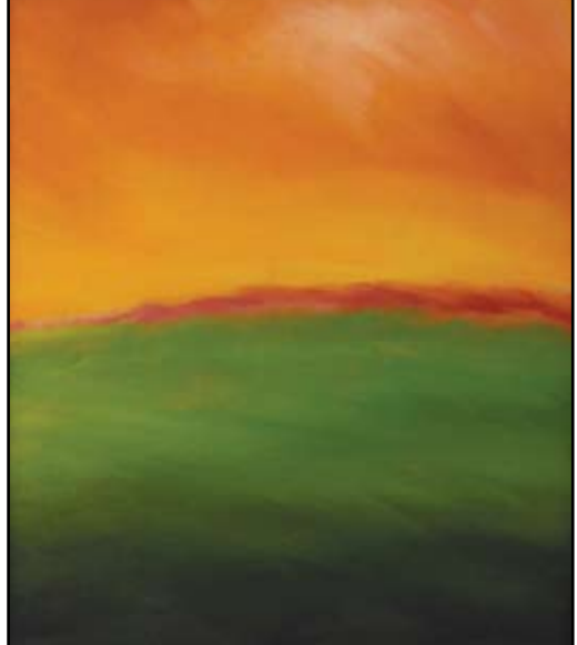
"Manor House View" by Kelly Everett also is for sale in the online auction.