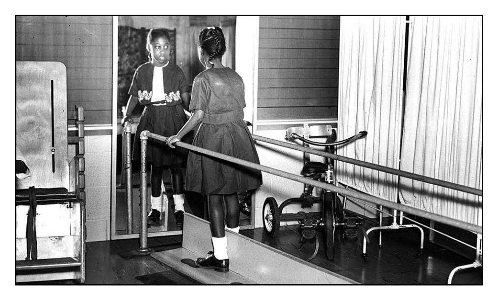
Also in the exhibit is this photo of a Toledo girl learning to walk again after polio at the Opportunity